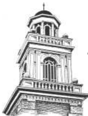
ST. PAUL UNITED CHURCH OF CHRIST Wapakoneta, Ohio