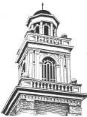
ST. PAUL UNITED CHURCH OF CHRIST Wapakoneta, Ohio

Annual Congregational Meeting Sunday, January 28 immediately following the 10:15 unified worship service Spaghetti Dinner to Follow