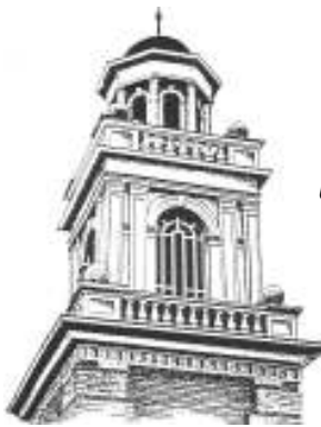
ST. PAUL UNITED CHURCH OF CHRIST Wapakoneta, Ohio

Annual Congregational Meeting Sunday, January 27 immediately following the 10:15 unified worship service Spaghetti Dinner to Follow